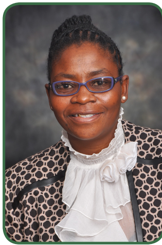
Hon. N Mahlangu (MPL)